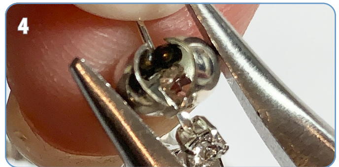
4. Use chain nose pliers to close the crimp cover. Finish the top of the headpin with a 4mm bead and a wrapped loop. Use a jump ring to attach your clasp.